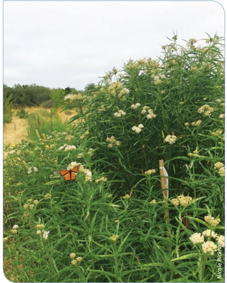
Milkweed is essential to the survival of Monarch butterflies. These native perennials are often used in our restoration work such as the Discovery Trail in Santa Rosa (shown above).

Agricultural Preservation and Open Space District, and the National Oceanic and Atmospheric Administration we are researching how Coho salmon use the Laguna floodplain.