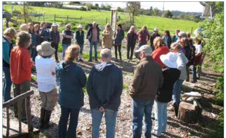
Learning Laguna Docents at Laguna Foundation's Spring Back-to-School event.

These friendly, responsible, knowledgeable volunteers are essential to the smooth functioning of all our public education programs. Fourteen people stepped up this year to participate in our 32-hour Laguna Guides training course. They graduated in June and got to work right away, increasing the Guides circle to 35 active volunteers. We venerate and thank the Laguna Guides for contributing more than 650 hours of volunteer service this year.