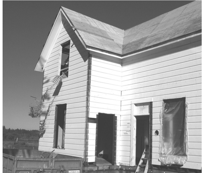
A volunteer workday for interior demolition of the second floor.