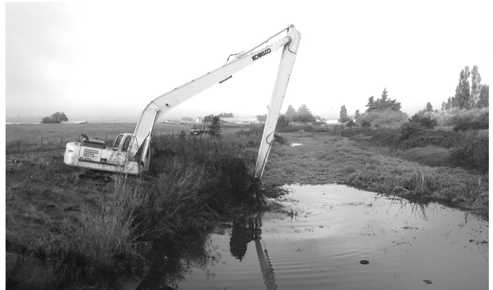
Mechanical removal of Ludwigia

We have observed that shallow stagnant areas experience regrowth almost immediately, while in contrast, deeper channels retain control for longer periods. However, it has become clear that recolonization of Ludwigia in open channels will be imminent unless systemic watershed problems are treated – addressing the ‘root’ of the problem so to speak! Therefore the next steps include developing programs that address such issues as excessive nutrient and sediment inputs, existing conditions of nutrient laden sediments throughout the channels and wetlands, the presence of perennial water in seasonal systems, the lack of riparian vegetation and more.